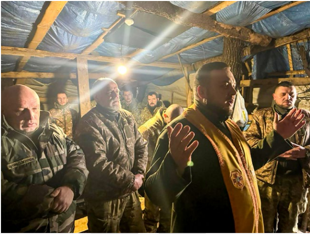
Near the frontlines, a Ukrainian Catholic chaplain celebrates the Divine Liturgy, Donetsk region (the HWF supported 72 military chaplains).