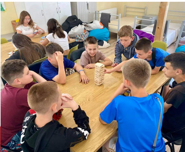
Summer camp for children of IDPs and those in need, Caritas Drohobych (supported by the HWF).