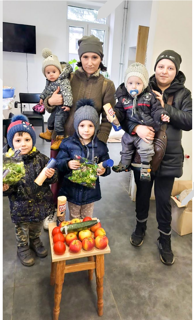
Women and children of IDPs at a shelter run by the Ukrainian Greek Catholic Church near Lviv (supported by the HWF).